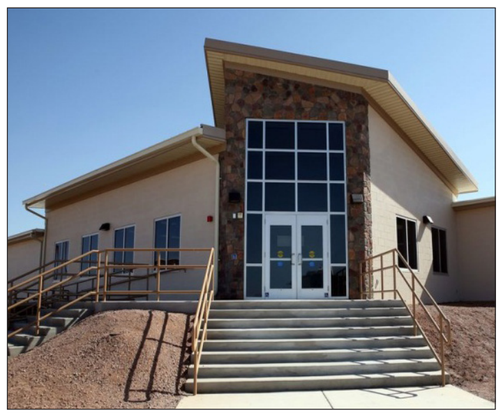
Outpatient Clinic at Fort Huachuca, Arizona

Throughout FY22, our team managed more than 100 projects valued at more than $473 million for our various DoD customers. In FY21, MRR awarded approximately $71 million in new medical facility repair/renovation & studies/design projects for the Defense Health Agency (DHA), the US Army Medical Command (MEDCOM) and the Medical Research and Development Command (MRDC), Fisher House, and the US Air Force Air